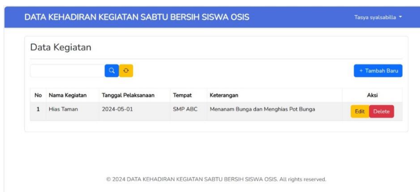
Figure 6. Student Activity Data Page

The activity data page is a crucial part of designing the Clean Saturday Present data system which is managed by OSIS students. This page functions as a means to manage information regarding various activities carried out by the organization, which will be input and managed in the system. The data