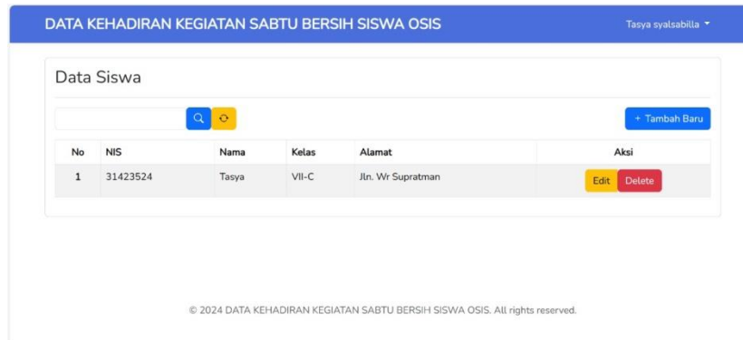
Figure 5. Student Data Page

Overall, dashboard pages are a very useful tool in information management, providing an efficient and effective way to monitor, analyze, and manage important data. By presenting data concisely and clearly, dashboards help users make better and faster decisions, supporting overall organizational or individual goals.