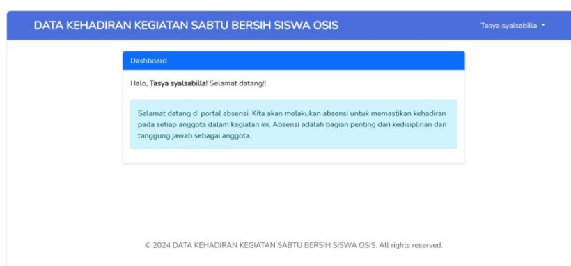
Figure 4. Dashboard Page